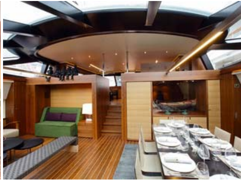
Main Salon 2