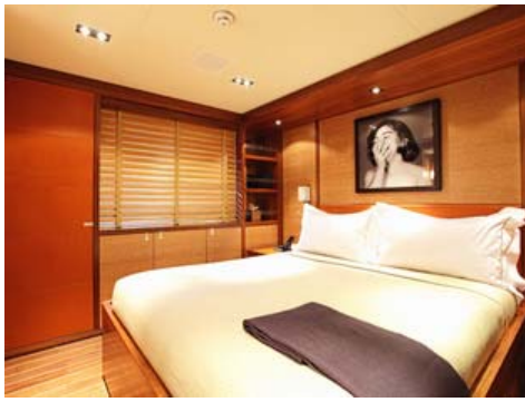
Guest Double Cabin