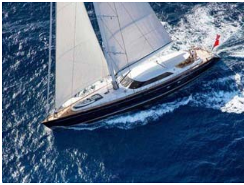
Running Shot 2