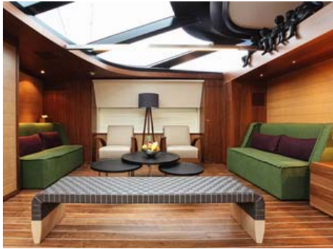
Main Salon 1

A vast selection of water toys including wakeboards & towables. She also boasts a fishing chair with full deep sea equipment for the fishing enthusiasts.