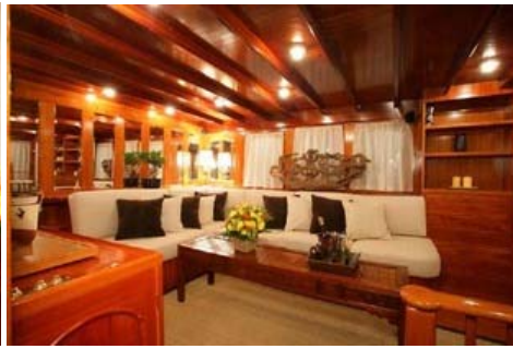
Salon Other view