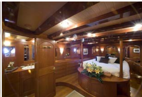
Master - other view