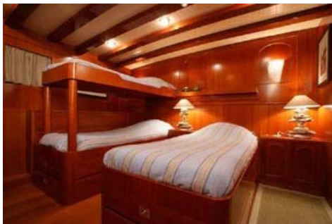
Convertible twin up to 4 guests