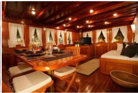
Dinning Area Other view